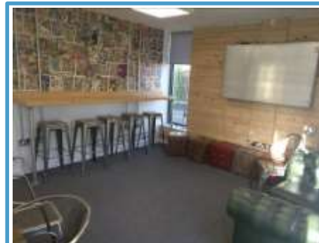
The Birch room used for youth work

We want to keep things moving and have begun looking at putting in a stained glass screen onto the extension. This is partly to discourage the local yoofs hanging around smoking fags in the doorway, but also to bring a splash of colour and soul to the front corner.