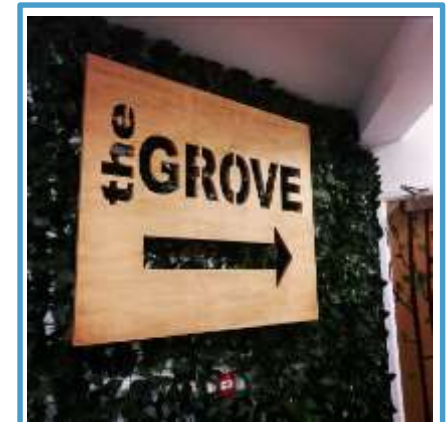
Entrance to the Grove extension

Alongside this, the Artshack is starting to reach the end of its life and are looking at the possibility of siting a few containers down the side of the building to run more youth activities and workshop space. We're waiting on the planners to see if they would consider allowing this kind of development.